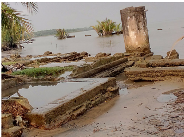
Figure 2. Foundation of prisons in current state at Forcados river front. Authors' fieldwork, 2025.