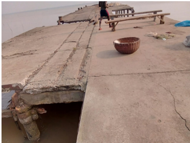
Figure 3. Current state of the Wharf structure designed and built by the Portuguese colonial masters when they first arrived in Forcados, 1486-1500s.