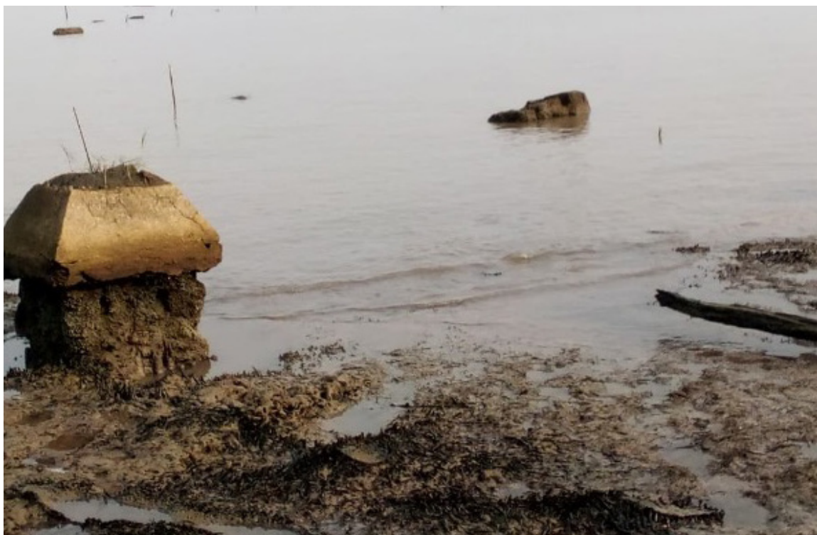
Figure 1. Forcados river, prison structures completely submerged by the shoreline of the river caused by erosion, seasonal flooding and neglect of the structures. Authors' fieldwork, 2025.