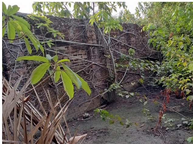
Figure 6. Fence structure of the apartment buildings. Authors' fieldwork, 2025.