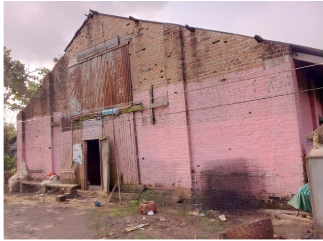
Figure 5. Apartments occupied by the British colonial masters. in Forcados.

By contrast, British colonial architecture introduced a more monumental and permanent aesthetic rooted in brick masonry, stone foundations, and imported construction technologies. This transformation coincided with the consolidation of British commercial power through the activities of the Royal British Company, later reorganised as the United Africa Company (UAC). 21 Following European territorial negotiations and imperial partition agreements, British firms expanded infrastructural investments from the late eighteenth century onwards, marginalising Portuguese influence in Nigerian coastal settlements. 22 Brick-built warehouses, customs houses, residential quarters, and administrative offices symbolised political authority and economic dominance, projecting stability and permanence within volatile trading