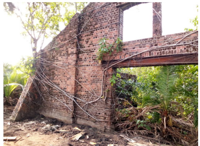
Figure 7. Current state of the apartment buildings in Forcados Authors' fieldwork, 2025.