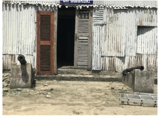
Figure 4. Portuguese Brazilian styled building in Abonnema Rivers State. Preconservation study of the Amayanabo's Palace, Warebi, 2024.